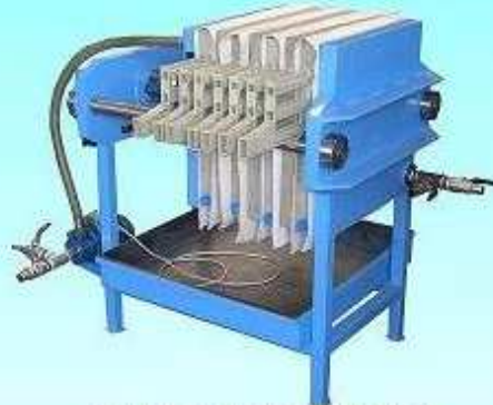
OIL FILTRATION PRESS