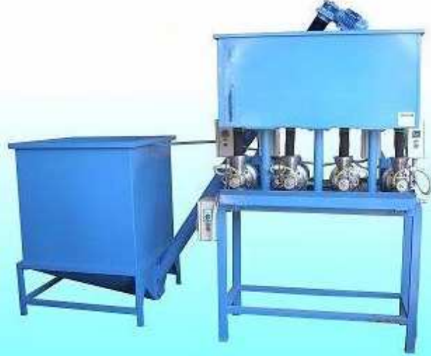
4 SETS OF COLD OIL PRESSES