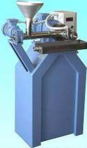
COLD OIL PRESS WITH PRE-GRINDER