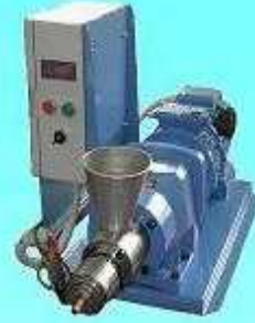
COLD OIL PRESSES WITH VARIO SPEED CONTROL