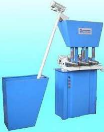
3 SETS OF COLD OIL PRESSES